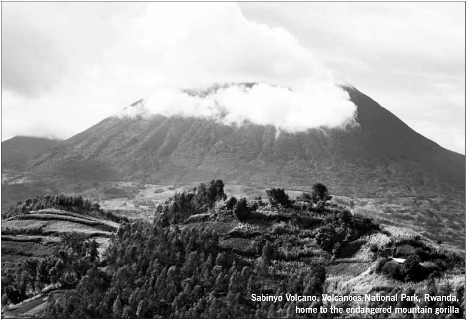
Sabinyo Volcano, Volcanoes National Park, Rwanda, home to the endangered mountain gorilla