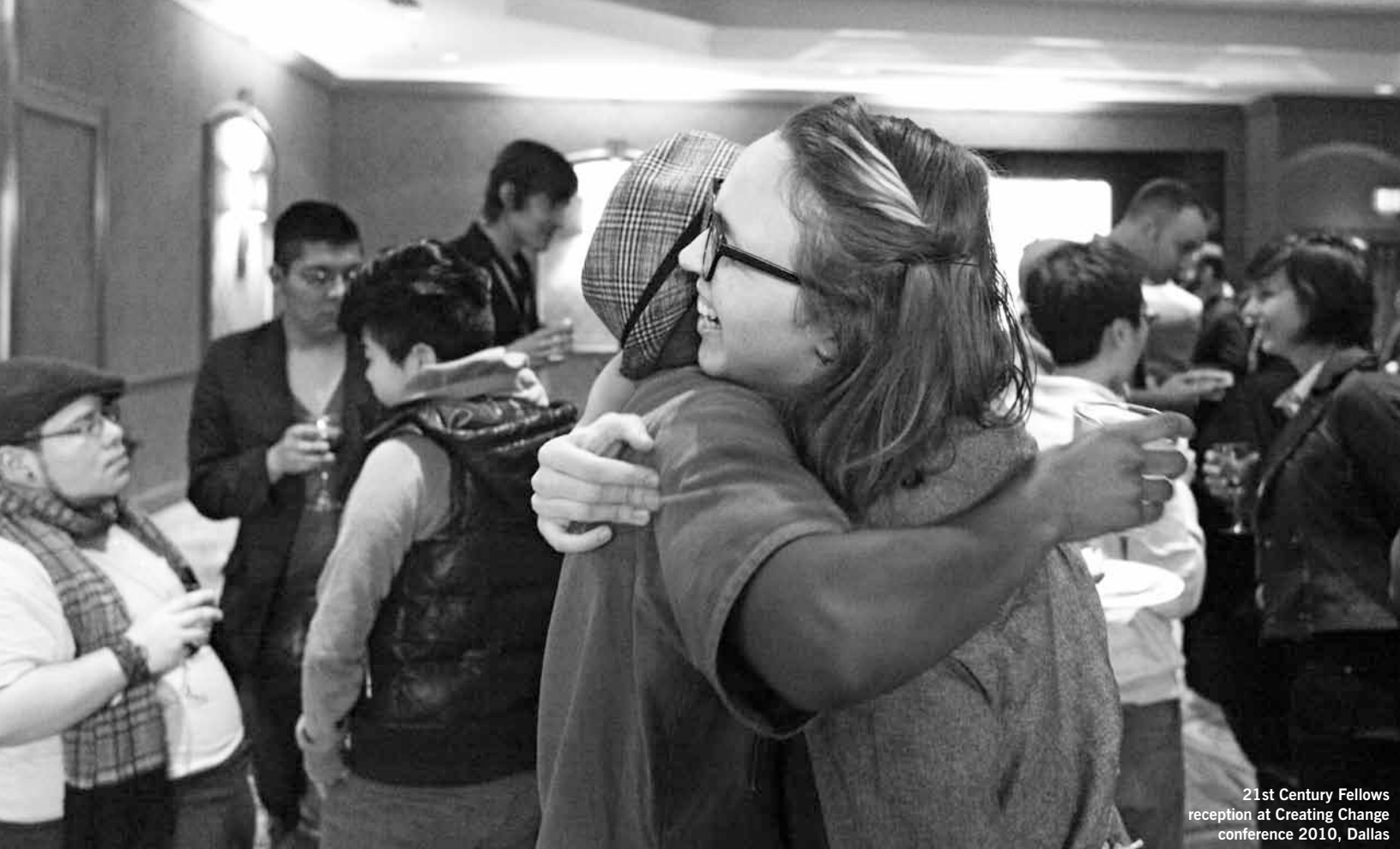
21st Century Fellows reception at Creating Change conference 2010, Dallas